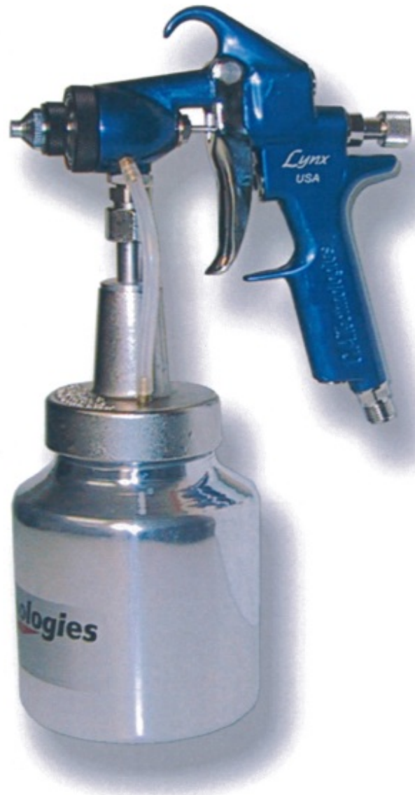
L100CM LYNX Conventional Multi Color

Converts touch up L100CM to full production Non-Bleeder Gun.